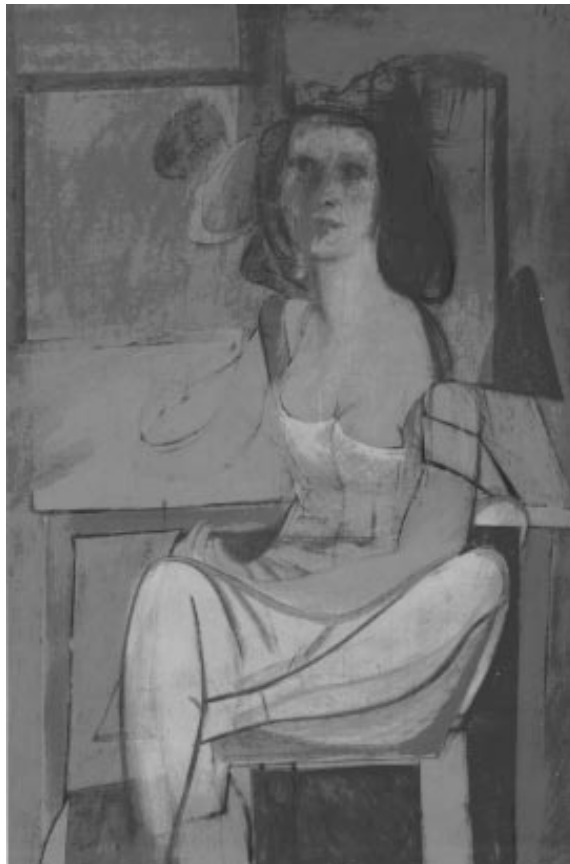
Seated Woman 1940

“Untitled #3,” 1986 next to “Woman,” 1949. Sometimes, as here, there seems to me an agonistic, even antagonistic, relationship between the older de Kooning and the youthful work he is conjuring up. All his previous brilliant habits as a painter—above all the hesitant, stop-and-start, open-and-close “de Kooning-type” drawing that other painters so idolized—are stripped down to their mellifluous dry bones. As if finally he found his famous 50s treatment of the female body not grotesque enough . So here it is again, done with no holds barred. It is as if he had