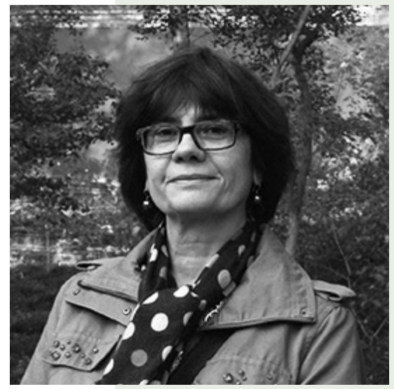
Una's Lecture: Catherine Malabou, see p. 8