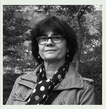
TOWNSEND CENTER FOR THE HUMANITIES

6 p.m. | Banatao Auditorium, Sutardja Dai Hall