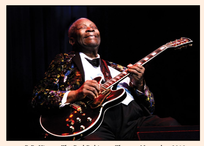
B.B. King at The Red Robinson Theatre, November 2010

lecture on music I had ever experienced. Experienced, rather than heard, because what he demonstrated about sounds forced me to question my values about listening and challenged me to form new paradigms about how to hear. I was a contemporary composer being educated in the Western classical tradition, and a B.B. King lecture was not