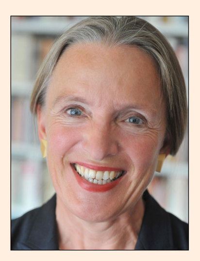
October 22 The Moral Economy of Trust