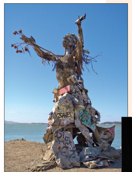
Reimagining the Urban, see p. 18